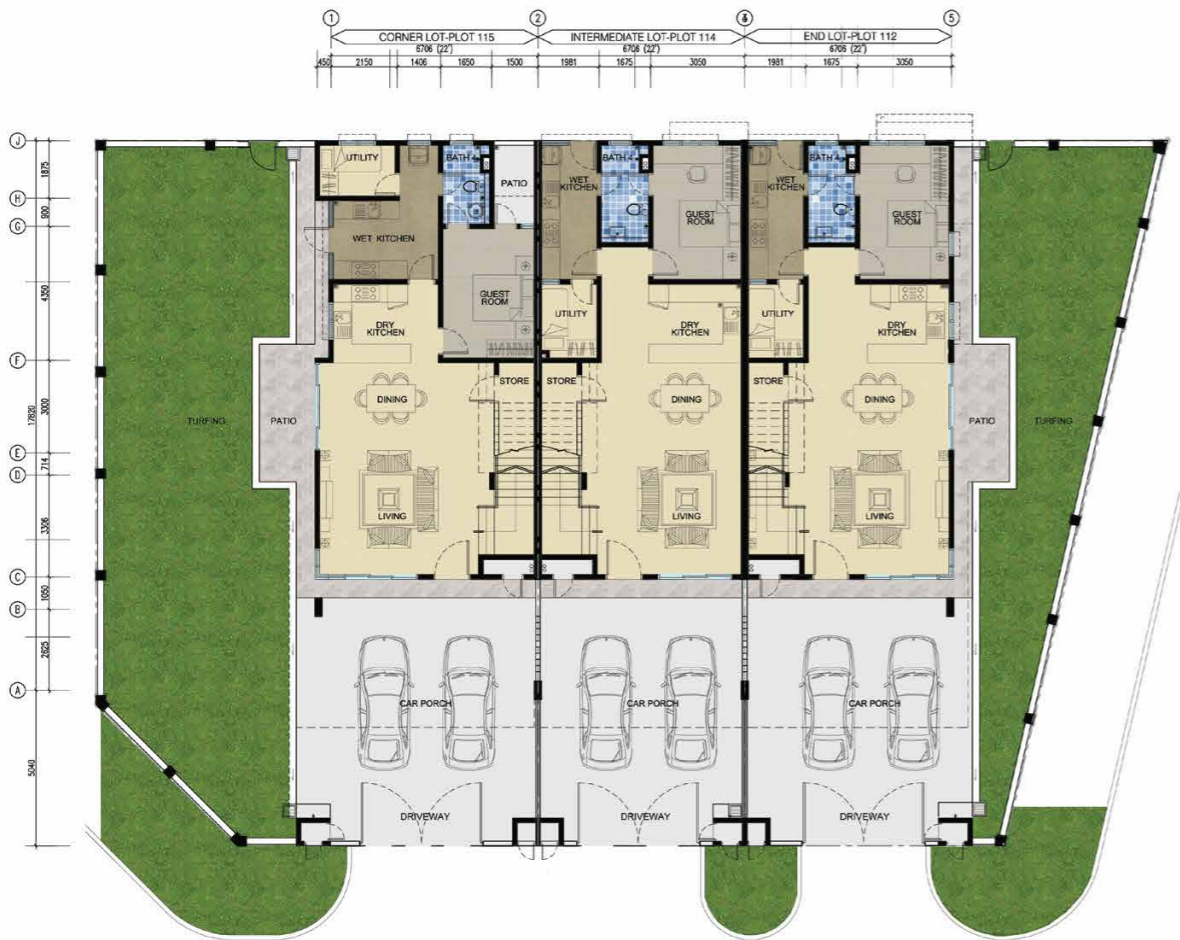
TYPE A ( 22' X 75' DSTH ) GROUND FLOOR PLAN