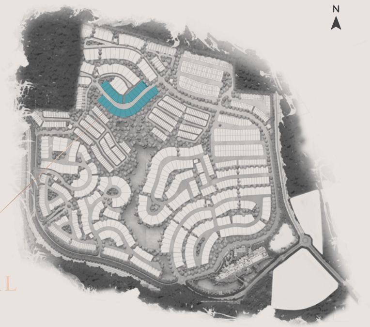
JADE HILLS MASTER PLAN