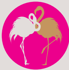
'Count the Flamingos' Contest