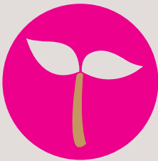
Free Admission to Farm by the Quay