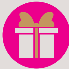
Mysterious Door Gifts