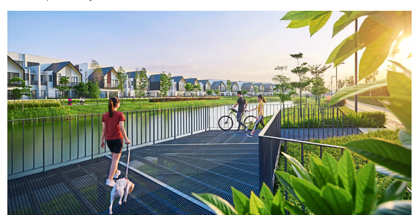
Each Lucent Residence home is connected to the precinct's Canal Park.

twentyfive.7 itself comprises 257 acres in the southwest growth corridor of Klang Valley, with connectivity to major routes including the Shah Alam Expressway (Kesas), South Klang Valley Expressway (SKVE), Kemuning-Shah Alam Highway (LKSA) and North-South Expressway Central Link (Elite). The township is projected for completion by 2030. §